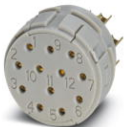
Contact insert, number of positions: 17, type of contact: Socket, Solder connection

Please be informed that the data shown in this PDF Document is generated from our Online Catalog. Please find the complete data in the user's documentation. Our General Terms of Use for Downloads are valid ( http://phoenixcontact.com/download )