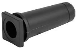
Cable Guard KT14 PVC Cable Guard for rewireable connectors