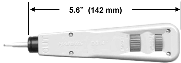
GPST (FRONT VIEW)

THIS COPY IS PROVIDED ON A RESTRICTED BASIS AND IS NOT TO BE USED IN ANY WAY DETRIMENTAL TO THE INTERESTS OF PANDUIT CORP.