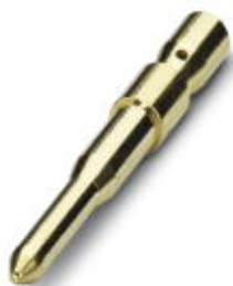
Crimp contact, turned, contact diameter: 1.5 mm, crimp range: 0.08 mm 2 ... 0.22 mm 2

Please be informed that the data shown in this PDF Document is generated from our Online Catalog. Please find the complete data in the user's documentation. Our General Terms of Use for Downloads are valid ( http://phoenixcontact.com/download )