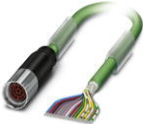
Cable plug in molded plastic, Length: 10 m, Color of outer sheath: green

Please be informed that the data shown in this PDF Document is generated from our Online Catalog. Please find the complete data in the user's documentation. Our General Terms of Use for Downloads are valid ( http://phoenixcontact.com/download )