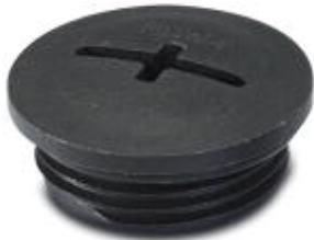
Screw plug, Cable gland material: Polyamide fiberglass reinforced, Connecting thread: Pg16, Color: black

Please be informed that the data shown in this PDF Document is generated from our Online Catalog. Please find the complete data in the user's documentation. Our General Terms of Use for Downloads are valid ( http://phoenixcontact.com/download )