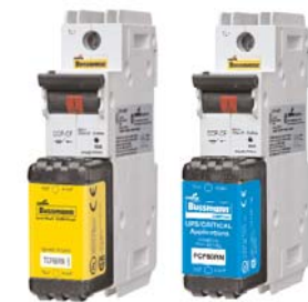
CCP_CF 1-, 2- & 3-Pole switched disconnects Data Sheet 1157