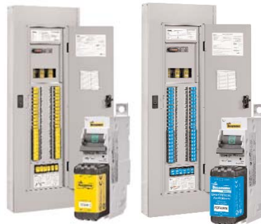
CCPB 1-, 2- & 3-Pole disconnects for the Quik-Spec™ Coordination Panelboard. Data Sheet 1160