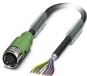
Sensor/actuator cable, 8-position, Variable cable type, shielded, free cable end, on Socket straight M12 SPEEDCON, A-coded, cable length: Free input (0.2 ... 40.0 m)

Please be informed that the data shown in this PDF Document is generated from our Online Catalog. Please find the complete data in the user's documentation. Our General Terms of Use for Downloads are valid ( http://phoenixcontact.com/download )