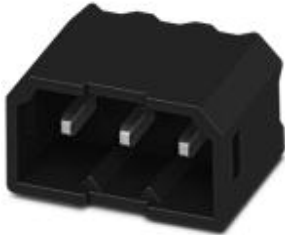
Header, Nominal current: 6 A, Number of positions: 6, Pitch: 2.5 mm, Color: black, Contact surface: Tin, Assembly: SMD/THT/THR

Please be informed that the data shown in this PDF Document is generated from our Online Catalog. Please find the complete data in the user's documentation. Our General Terms of Use for Downloads are valid ( http://phoenixcontact.com/download )