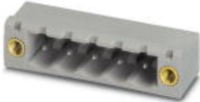
The figure shows a 5-pos. version of the product in gray

Header, Nominal current: 12 A, Rated voltage (III/2): 320 V, Number of positions: 3, Pitch: 5.08 mm, Color: black, Contact surface: Tin, Mounting: Wave soldering