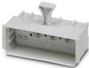
Contact insert upper part

Please be informed that the data shown in this PDF Document is generated from our Online Catalog. Please find the complete data in the user's documentation. Our General Terms of Use for Downloads are valid ( http://phoenixcontact.com/download )