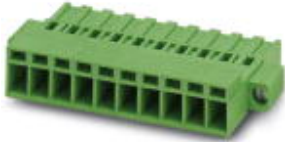
The illustration shows a 15-position version

Plug component, Nominal current: 12 A, Rated voltage (III/2): 320 V, Number of positions: 21, Pitch: 5.08 mm, Connection method: Crimp connection, Color: green, Corresponding female crimp contacts with current [A] and conductor cross section range [mm 2 ] data: 10A/MSTBC-MT 0,5-1,0 (3190564); 10A/MSTBC-MT 0,5-1,0 BA (3190645); 12A/MSTBC-MT 1,5-2,5 (3190551); 12A/MSTBC-MT 1,5-2,5 BA (3190658). BA = Bandkontakte