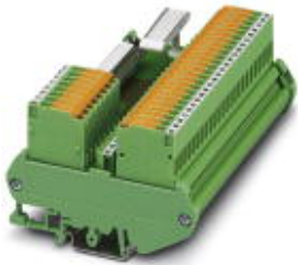
VARIOFACE module, with knife disconnect terminal blocks for: -S800 I/O input module, module width: 126.5 mm

Please be informed that the data shown in this PDF Document is generated from our Online Catalog. Please find the complete data in the user's documentation. Our General Terms of Use for Downloads are valid ( http://phoenixcontact.com/download )