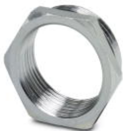
Reducing adapter, Brass, nickel-plated, connecting thread: Pg16, color: silver, with O-ring

Please be informed that the data shown in this PDF Document is generated from our Online Catalog. Please find the complete data in the user's documentation. Our General Terms of Use for Downloads are valid ( http://phoenixcontact.com/download )