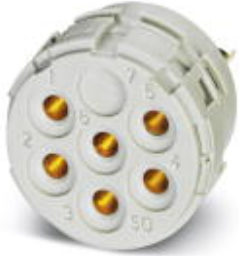
Contact insert, Number of positions: 6, Type of contact: Socket, Solder connection

Please be informed that the data shown in this PDF Document is generated from our Online Catalog. Please find the complete data in the user's documentation. Our General Terms of Use for Downloads are valid ( http://phoenixcontact.com/download )