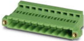
The illustration shows a 15-position version

Please be informed that the data shown in this PDF Document is generated from our Online Catalog. Please find the complete data in the user's documentation. Our General Terms of Use for Downloads are valid ( http://phoenixcontact.com/download )