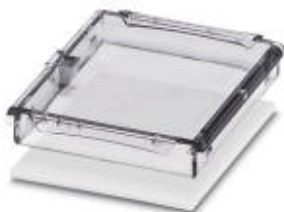
Installation component housing, Housing cover, Cross connection: Component housing, color: transparent, width: 53.6 mm

Please be informed that the data shown in this PDF Document is generated from our Online Catalog. Please find the complete data in the user's documentation. Our General Terms of Use for Downloads are valid ( http://phoenixcontact.com/download )