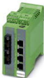
Ethernet Lean Managed Switch with four 10/100 Mbps RJ45 ports and two 100 Mbps FX-SC single-mode ports

Please be informed that the data shown in this PDF Document is generated from our Online Catalog. Please find the complete data in the user's documentation. Our General Terms of Use for Downloads are valid ( http://phoenixcontact.com/download )