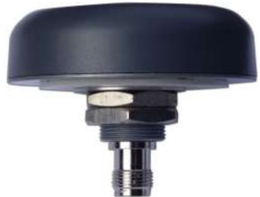
TW3040/TW3042 Dimensions (mm) Flat Radome shown. Conical Radome also available