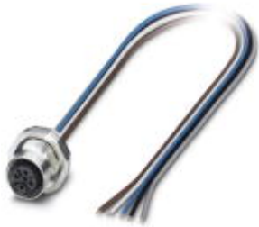
Sensor/actuator flush-type socket, 5-pos., M12, A-coded, rear/screw mounting with Pg9 thread, with 0.5 m TPE litz wire, 5 x 0.34 mm 2 , stainless steel version

Please be informed that the data shown in this PDF Document is generated from our Online Catalog. Please find the complete data in the user's documentation. Our General Terms of Use for Downloads are valid ( http://phoenixcontact.com/download )