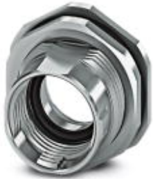
Housing screw connection, SocketLink:M12-SPEEDCON, Rear mounting, M15 x 1

Please be informed that the data shown in this PDF Document is generated from our Online Catalog. Please find the complete data in the user's documentation. Our General Terms of Use for Downloads are valid ( http://phoenixcontact.com/download )