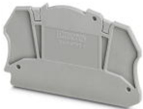
Cover, width: 2.2 mm

Please be informed that the data shown in this PDF Document is generated from our Online Catalog. Please find the complete data in the user's documentation. Our General Terms of Use for Downloads are valid ( http://phoenixcontact.com/download )